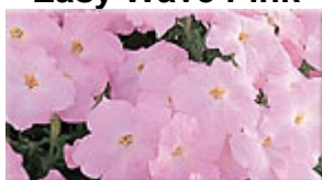
Easy Wave Shell Pink